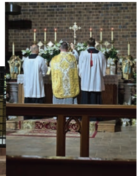
Celebrating Easter Mass