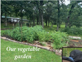
Our vegetable garden