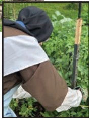
Gardening, Vegetables & Flowers