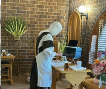
Kitchen work, cooking and serving