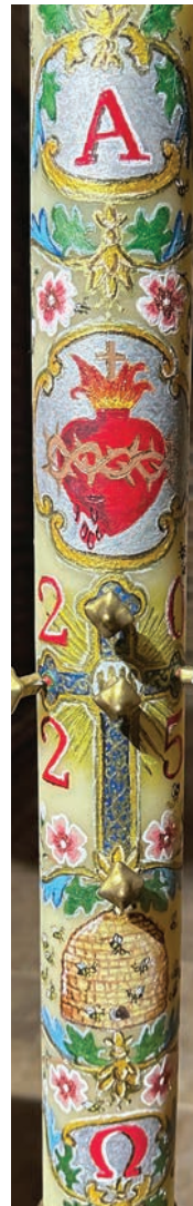
Paschal Candle handpainted by the Nuns

We then had the full, inspiring Vigil with its readings, prayers and ceremonies, which brings to life the paschal mystery and the glory of the Risen Christ.