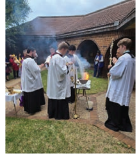
Starting the Paschal Fire