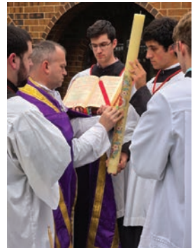
Preparing the Paschal Candle