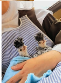
Caring for our chickens and gathering eggs