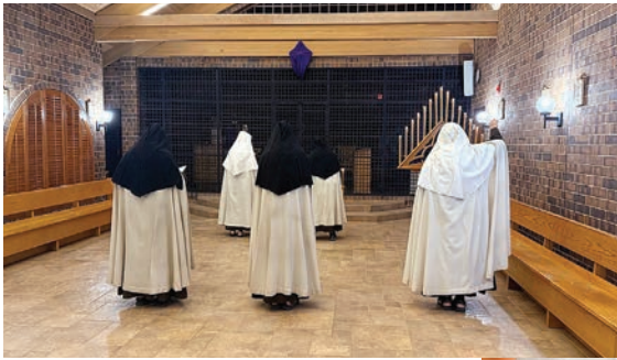
Our Prayer in Choir, Holy Week Tenebrae