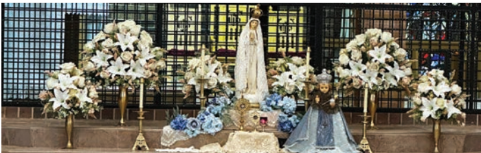
Our Choir Altar decorated for May devotions