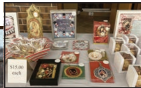
Arts and crafts, including soap and handmade items